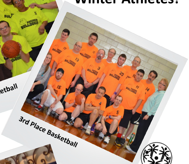
3rd Place Basketball