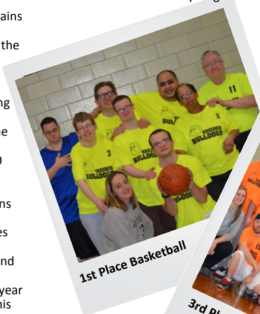
1st Place Basketball