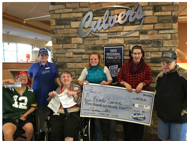
Culver's of Galena recently donated 10% of their daily proceeds ($592) to the Galena and Stockton homes. Thank you Culver's for Giving Back!