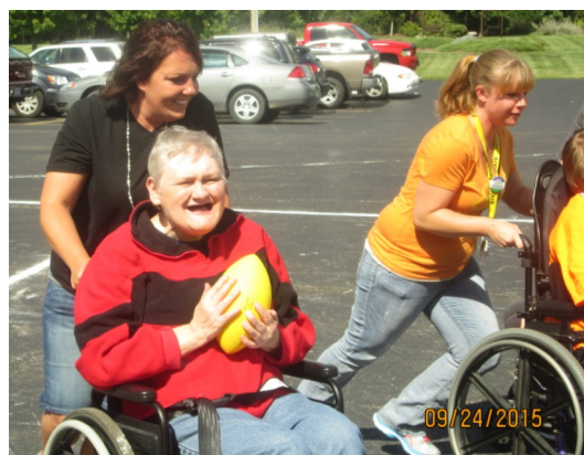
Clients and staff take a break from work and enjoy a fun game of wheelchair football on a sunny afternoon at Day Services.