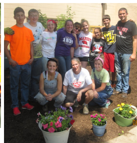
A big "Thank you" to Marist High School in Chicago who helped build the sensory garden this summer. The kids and staff were in Dixon three days to volunteer at different places. They moved a semi load of mulch. Great group of volunteers!