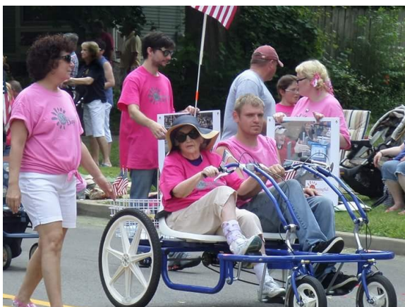
Kreider showed off both two-seater bikes in the Petunia Festival Parade this summer. The bikes were both bought with money from fundraisers and memorial gifts. We are looking to buy a third one very soon.