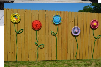
Artwork in the home and on this fence is very unique.